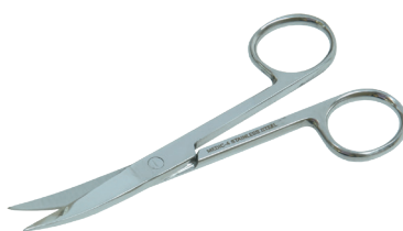
Basic Surgical Scissor