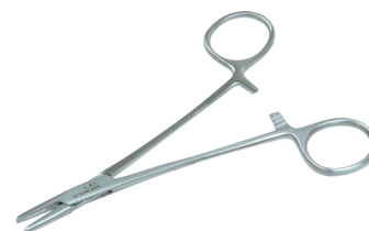
Basic Mayo Hegar NeedleHolder